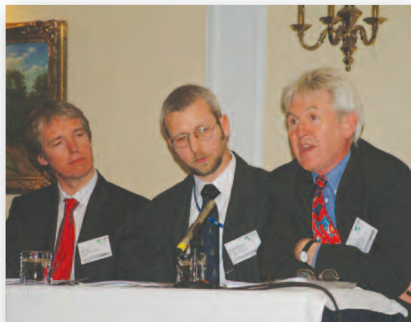
Vitae policy forum 2010

Demonstrating value for money and exploring the effectiveness of researcher development activities has also been a key theme for 2009. In September at the Vitae conference, we launched a report of 27 evaluation activities across the HE sector. This was the culmination of work undertaken by the Rugby Team 12 to develop an impact framework tailored to researcher development. The report demonstrated improved successes in researchers' grant applications, fellowships and employability as a result of training.