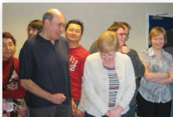
Part-time researcher course 2009

In May, Vitae launched a research report and a set of new learning materials for working with Part-time researchers . A collaboration of 19 Vitae Midlands Hub institutions developed a flexible training framework which recognises the diversity of part-time researchers from a range of institutions. The materials include a training resource pack for use by UK HEIs and a DVD providing tips and advice from successful part-time researchers. The model has received positive feedback with 12 institutions either hosting or co-hosting part-time researcher events in 2009 and 13 events already planned for 2010 in the Midlands region alone.