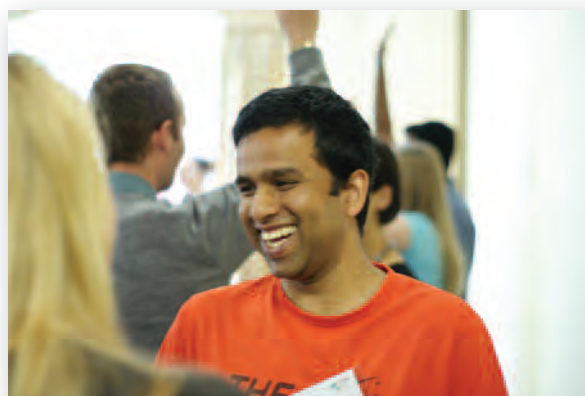
Careers in academia 2009

Vitae connections 2009 participant quotes