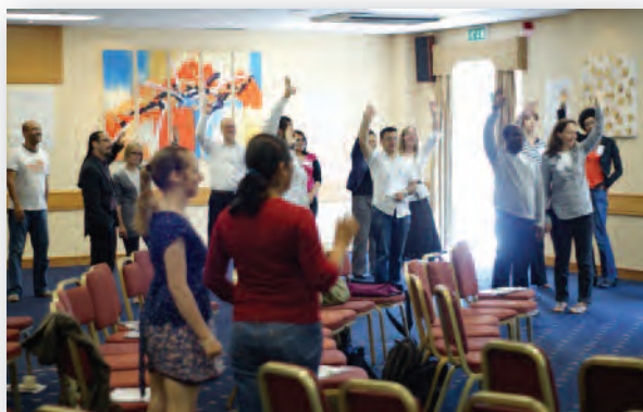
Leadership in action 2010

Understanding the views of employers outside higher education is critical to be able to train our researchers for what has been termed an 'unimaginable future' 13 . In 2009 we undertook a survey of over 100 non-HE employers to explore their views of recruiting doctoral researchers. Over 70% said they would welcome more applications from doctoral graduates.