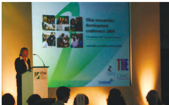
Vitae researcher development conference 2009

A key theme for the conference was the potential for changes in the 'Roberts funding' 19 stream which has provided dedicated funds to institutions since 2003.