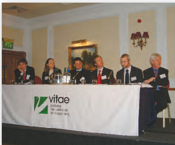
Vitae policy forum 2010

'As result of the policy forum I will review the strategy of my university'