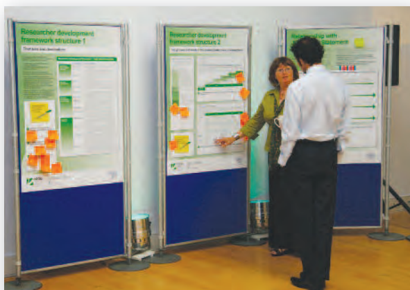
The Researcher Development Framework at the Vitae researcher development conference 2009

For example, the South West and Wales Hub held a briefing and feedback session on the RDF in October and the East of England Hub held a regional consultation workshop in November with representatives from four institutions. Hubs used personal contacts to encourage uptake of CROS 2009 with a significant degree of success. All Hubs encouraged (and some supported) bids to the Vitae Innovate fund in 2009. Hubs contribute to the national impact and evaluation agendas by ensuring linkage between regional steering groups and national groups such as the Rugby Team, now known as Impact and Evaluation Group: researcher skills and careers (IEG).