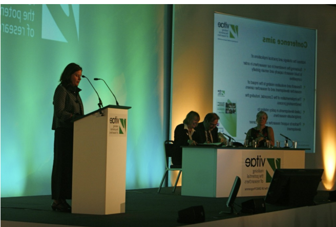
Photo from the plenary session at the Vitae conference 2009

The full conference report will be available shortly. In the meantime, you can read about highlights and outcomes of the conference, watch the plenary speakers online, view presentation slides from the speakers and workshops facilitators, and use the blog for any conversations you'd like to continue by visiting at http://www.vitae.ac.uk/vitaeconference09