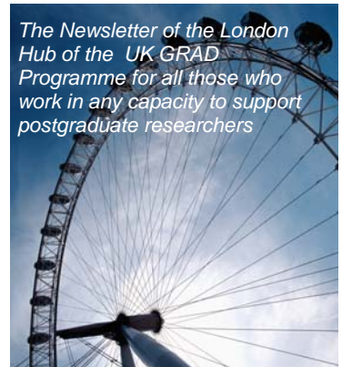
The Newsletter of the London Hub of the UK GRAD Programme for all those who work in any capacity to support postgraduate researchers

The meeting will be in Brighton and will start at 10.30