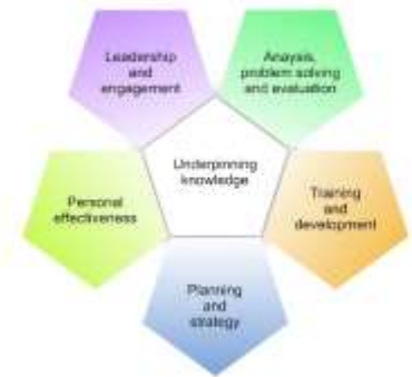
Vitae Career Framework for Researcher Developers

The event explored the issue of professionalisation of researcher development and how we define our identities as researcher developers. Several presenters have had success by making the case to management about the importance of practice-based research to improve training and development opportunities within their institution. Thus, the research project becomes part of the normal workload rather than an “extra” thing to do, and forms part of annual reviews and goals.